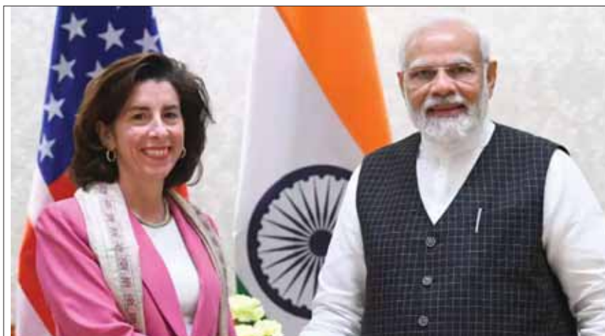
US commerce secretary Gina Raimondo had a fruitful meeting with P.M. Modi in Delhi in March 23

U.S. Commerce Secretary Gina Raimondo, who was in India recently, recounted her recent interactions with PM Modi, during an event hosted by the Indian Embassy in Washington on April 15 Saturday.