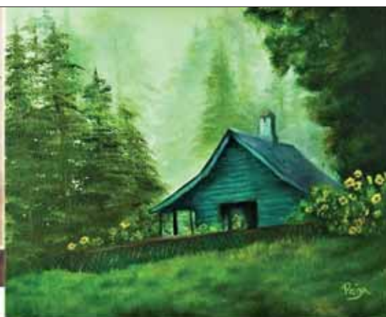
Sunflowers - Kalatop rest house Dalhousie Oil on canvas