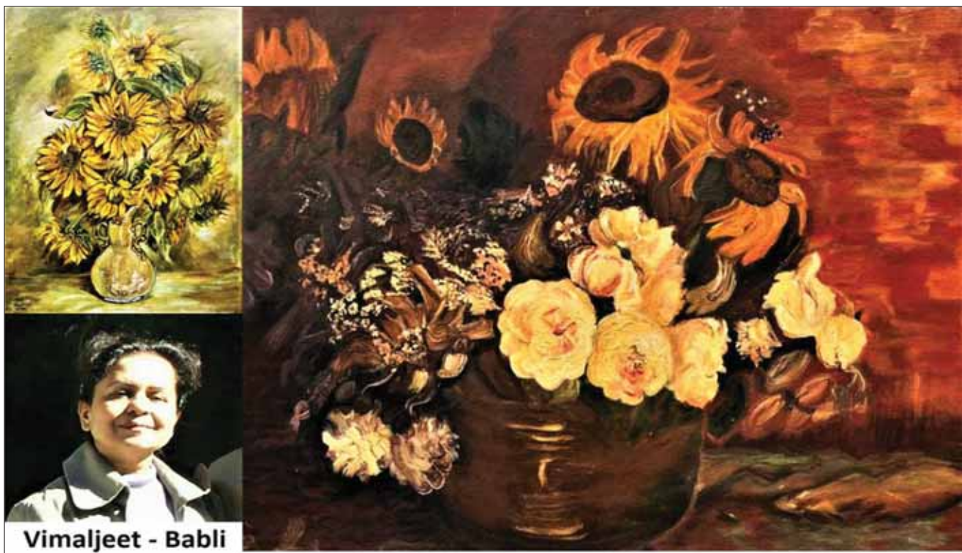
Vimaljeet - Babli

yellow, gold, orange, bronze, red, and burgundy.