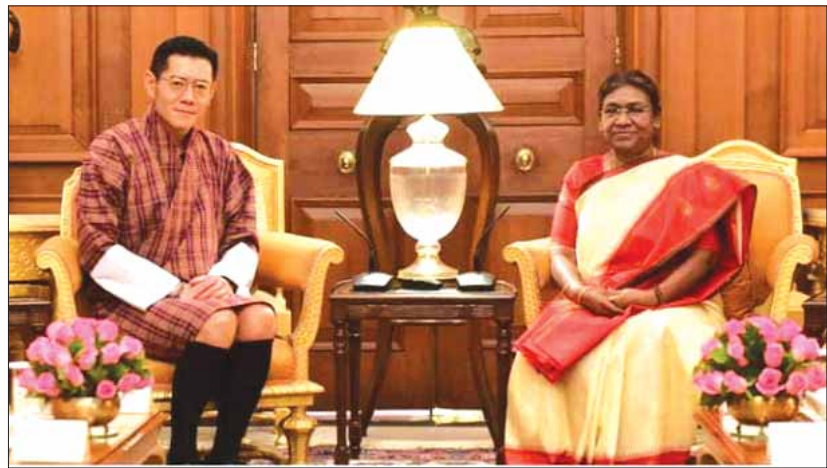
President Droupadi Murmu Welcomes Bhutan King Jigme Wagchuck, Says India Will Remain A Reliable Partner Of Bhutan