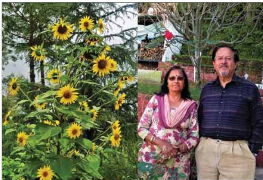
"one, very large plant, 12 ft in height, is loaded with more than 55 nos of 7 inches dia., each, flower".

Besides, the use of yellow in "Sunflowers," the artist also features green, orange, and a touch of red and blue. In the 'Mix Sunflower' the color range spans from cream to lemon-