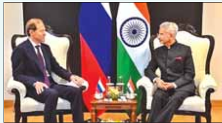
External Affairs Minister S. Jaishankar during a meeting with Deputy Prime Minister and Minister of Industry & Trade of Russia Denis Manturov, in New Delhi, Tuesday, April 18, 2023.

Recently, Prime Minister Narendra Modi and