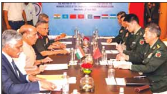
Defence minister Rajnath Singh holds a bilateral meeting with his Chinese counterpart Li Shangfu on the sidelines of the SCO Defence Ministers' meeting in New Delhi