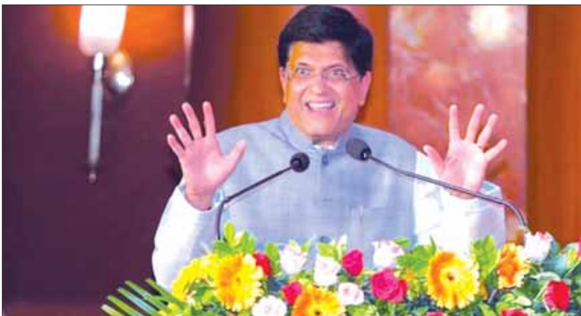
Commerce and Industry Minister Piyush Goyal

C OMMERCE and Industry Minister Piyush Goyal on 22nd April Saturday expressed hope that traders will soon be able to settle foreign trade in the rupee currency as several banks from different countries are opening special Vostro accounts with Indian banks. A vostro account is an account a corre-