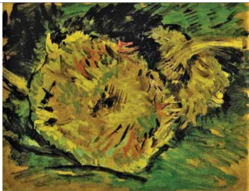
Vincent Van Gogh, Sunflowers August 31, 1887

"The sunflower is mine." Van Gogh wrote. He painted a total of five large canvases with sunflowers in a vase, with three shades of yellow 'and nothing else' There were a total of 11 works, one of which was lost during the