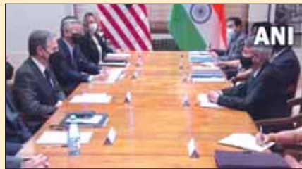
Quad Meeting: The 4th Quad Foreign Ministers' Meeting at Delhi "Quad Has Worked So Well Because Of Strong Bilateral Ties"-S.Jaishankar

We unequivocally condemn terrorism and violent extremism in all its forms and manifestations. We denounce the use of terrorist proxies and emphasize the importance of denying any logistical, financial, or military support to terrorist organizations which could be used to launch or plan terrorist attacks, including transnational and cross-border attacks. We reiterate our condemnation of terrorist attacks, including 26/11 Mumbai, which claimed lives of citizens from all Quad countries, and Pathankot attacks. We are committed to working together with our regional and international partners to promote accountability for the perpetrators