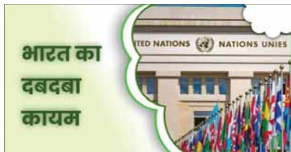
India has been elected to the United Nations Statistical Commission for four years.

India was elected by acclamation to the Commission on Narcotic Drugs along with Argentina, Burundi, Chile, China, the Dominican Republic, Guatemala, Indonesia, Japan, Kenya, Mexico, Morocco, Nigeria, Peru, Qatar, Singapore, South Africa, Thailand, the United Republic of Tanzania, Uruguay and Zimbabwe for a four-year