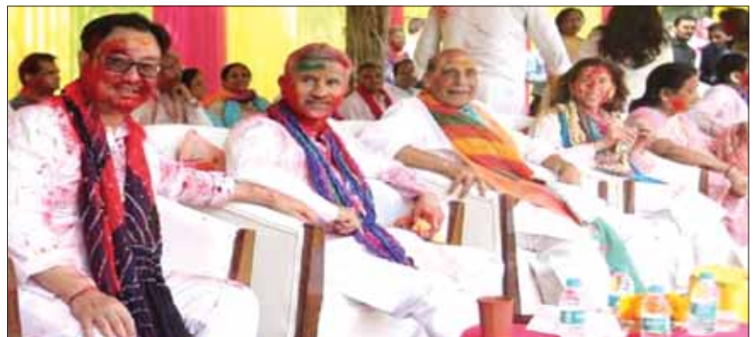
L to R :Union Law Minister Kiren Rijiju, Eam Jaishankar, Union Defence Minister Rajnath Singh and us Commerce Secretary Raimondo attends holi 2023 celebrations: at Defence Minister Rajnath Singh's official residence in delhi during Raimondo visit to India.

Meanwhile, pictures and video clips of Ms. Raimondo playing Holi at Defence Minister Rajnath Singh's residence have gone viral on social media, as it reflects the strong relationship between the U.S. and India.