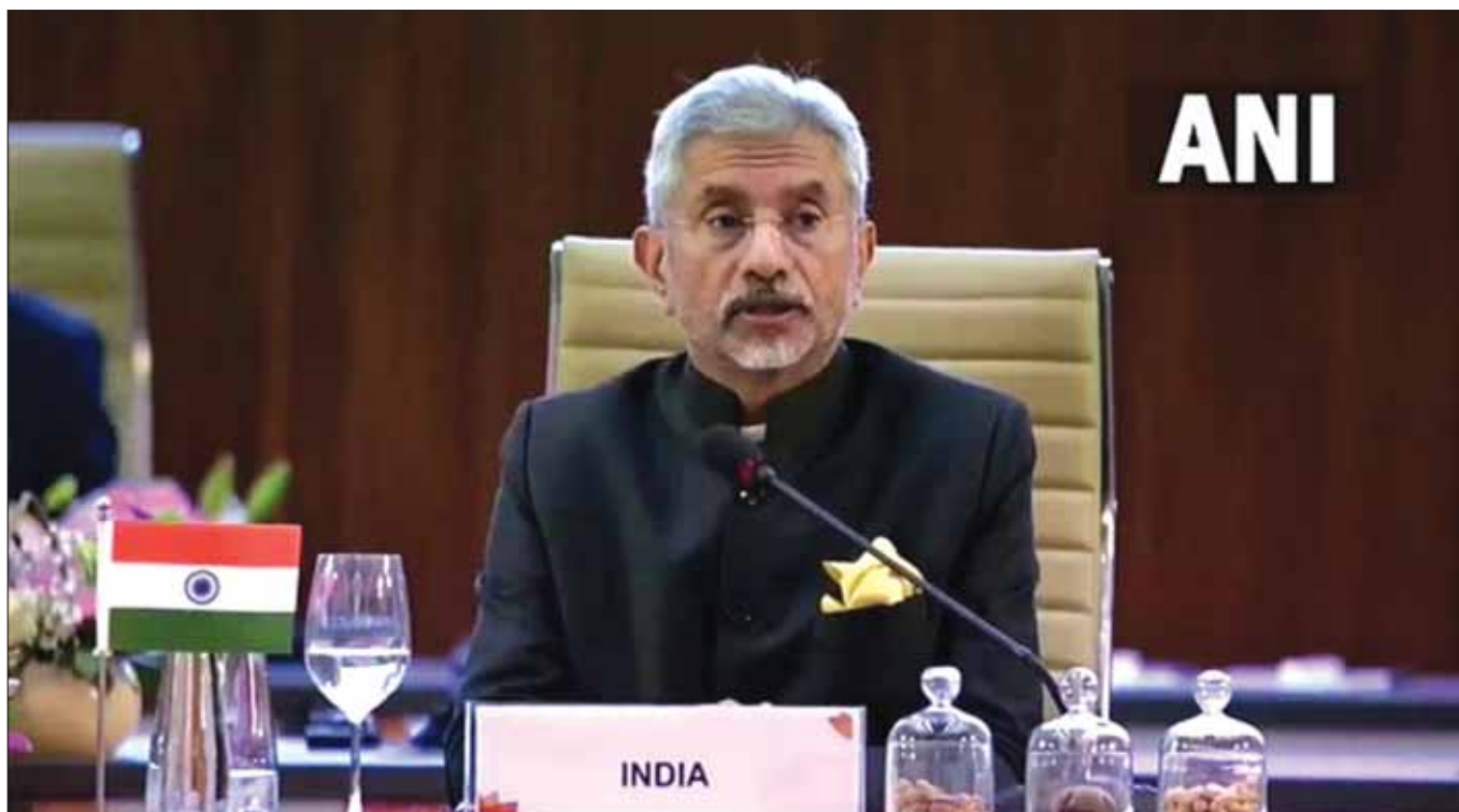
External Affairs Minister S. Jaishankar hails significant feat

INDIA WAS ELECTED BY ACCLAMATION TO THE COMMISSION ON NARCOTIC DRUGS ALONG WITH ARGENTINA, BURUNDI, CHILE, CHINA, THE DOMINICAN REPUBLIC, GUATEMALA, INDONESIA, JAPAN, KENYA, MEXICO, MOROCCO, NIGERIA, PERU, QATAR, SINGAPORE, SOUTH AFRICA, THAILAND, THE UNITED REPUBLIC OF TANZANIA, URUGUAY AND ZIMBABWE FOR A FOUR-YEAR TERM OF OFFICE, BEGINNING JANUARY 1, 2024.