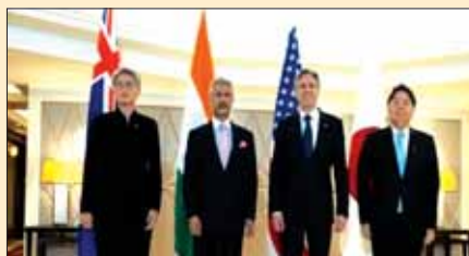
L to r Australia's Penny Wong, S Jaishankar, US Antony Blinken and Japan Yoshimasa Hayashi At QUAD meeting in Delhi

Reaffirming our consistent and unwavering support for ASEAN centrality and unity, and the ASEAN-led architecture, including the East Asia Summit and ASEAN Regional Forum, we remain committed to supporting implementation of the ASEAN Outlook on the Indo-Pacific (AOIP) and will be guided in our work by ASEAN's principles and priorities.